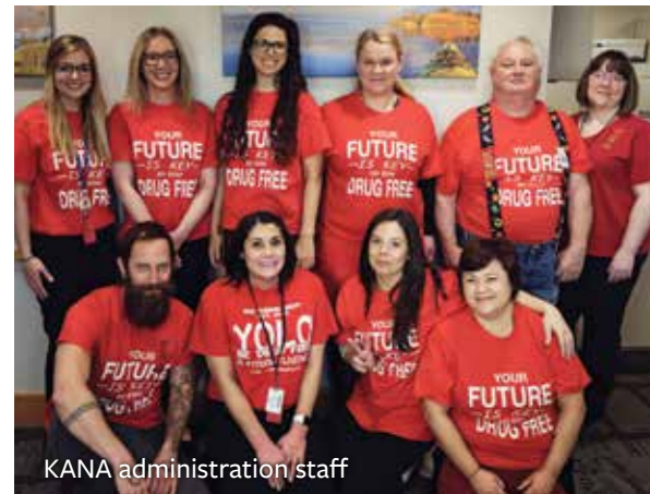
KANA administration staff