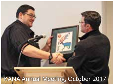
KANA Annual Meeting, October 2017