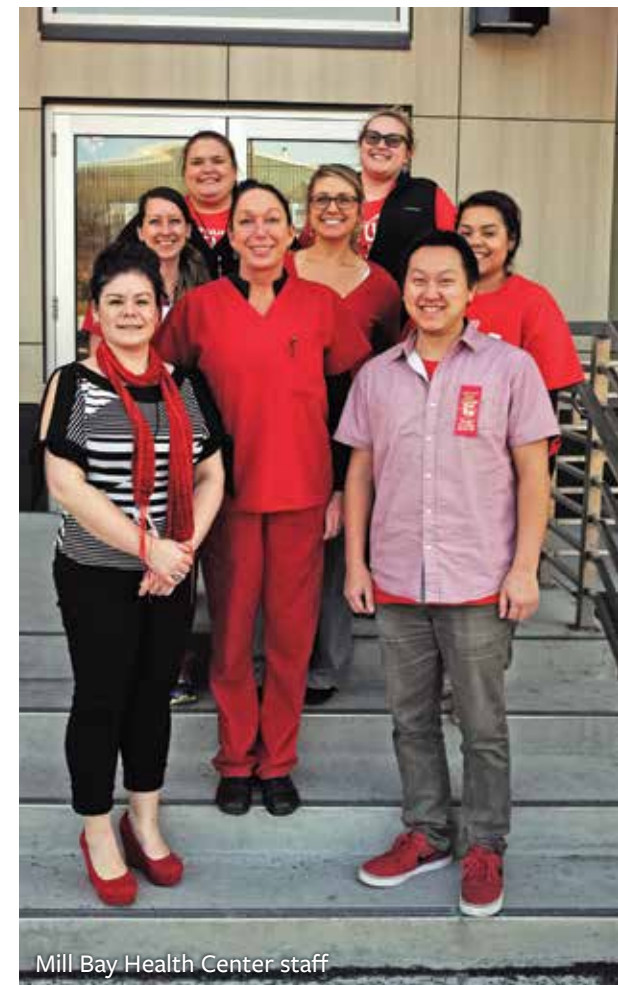
Mill Bay Health Center staff