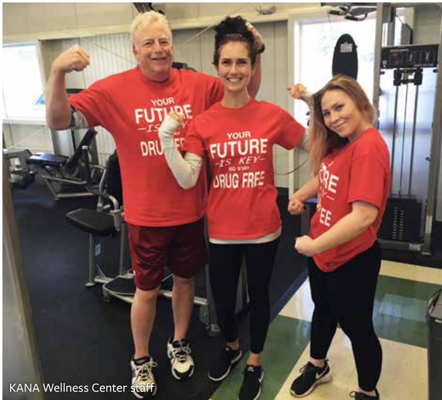
KANA Wellness Center staff