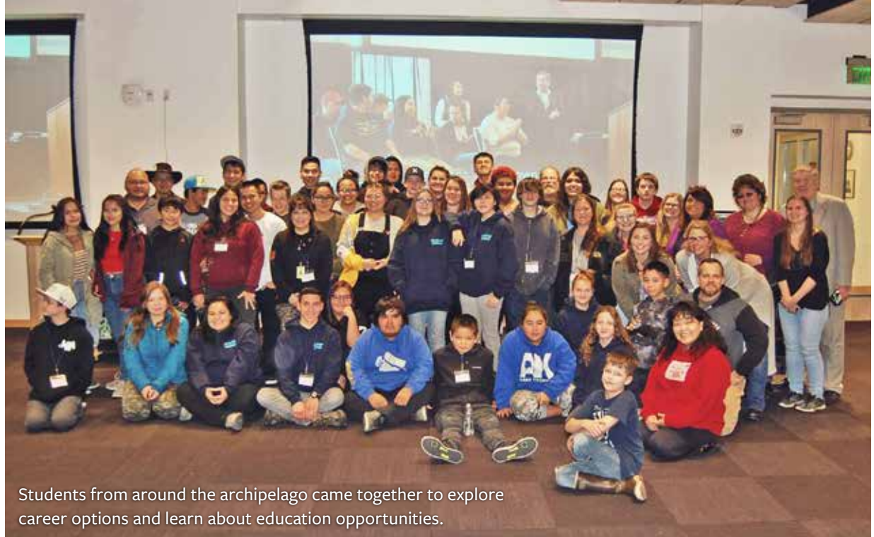
Students from around the archipelago came together to explore career options and learn about education opportunities.

Providing cultural activities during the event is important and this year students made Alutiiq masks and listened to a lecture from the Alutiiq Museum about the meaning of Talking Rocks. Local