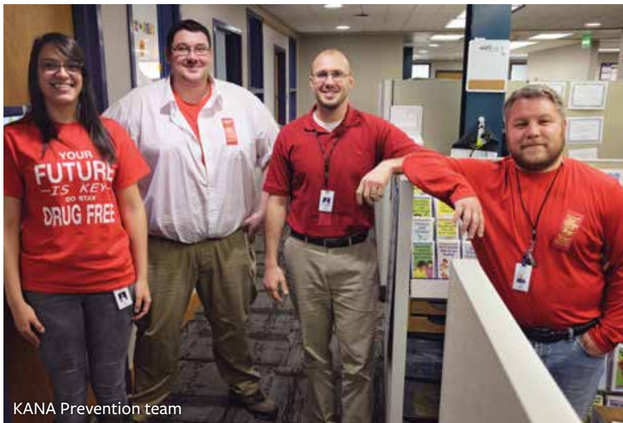
KANA Prevention team